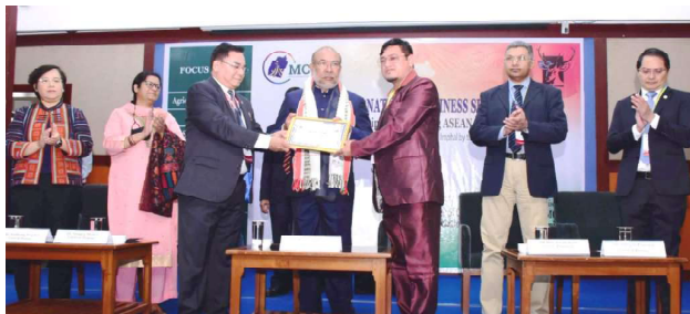
IT News Imphal, Nov 24:

Under the UDAAN Scheme of the government of India there are plans to start international flights from Imphal Airport to Mandalay and Bangkok, Chief Minister N. Biren Singh said today.