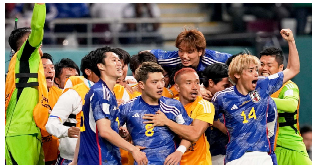
Japanese players celebrate winning the World Cup group E soccer match against Germany at the Khalifa International Stadium in Doha, Qatar

Then Asano, who plays for Bochum, sprinted clear of Nico Schlotterbeck and beat Neuer from a narrow angle in the 83rd